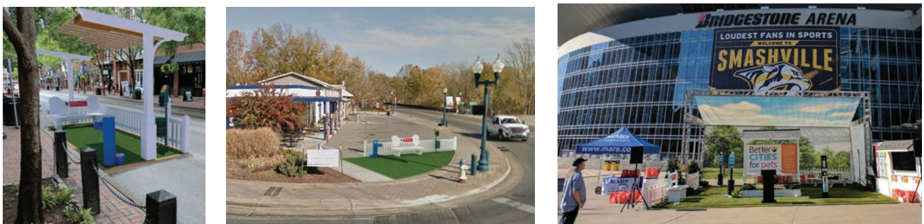
Renderings: Nashville Civic Design Center